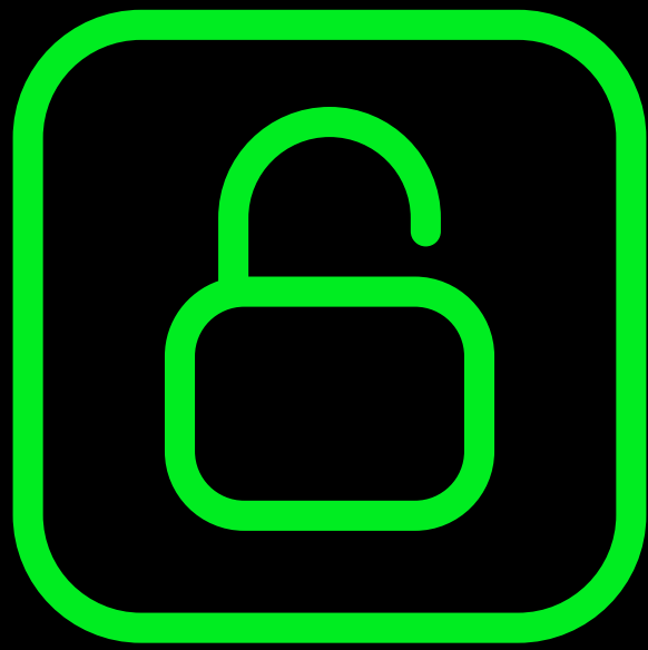
Fixed Price Services