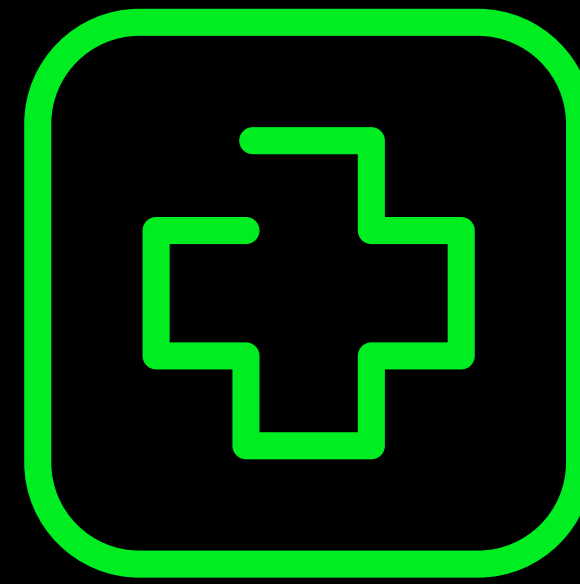
Unlimited Service Options