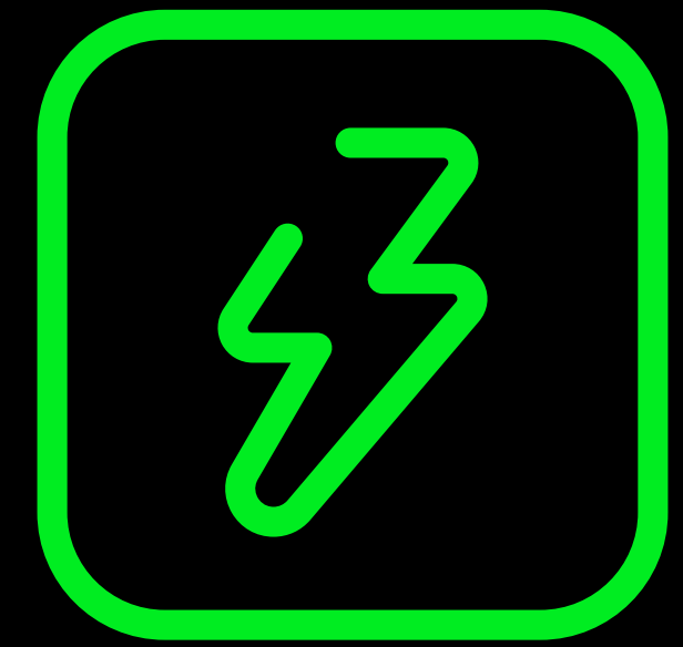
Flexible Payment Options